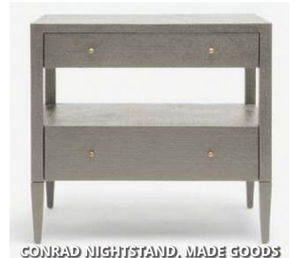
CONRAD NIGHTSTAND, MADE GOODS