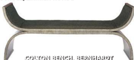
COLTON BENCH, BERNHARDT