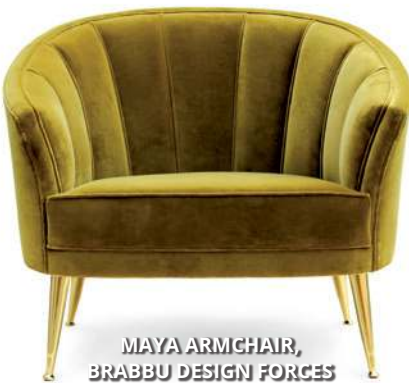
MAYA ARMCHAIR, BRABBU DESIGN FORCES

Etch Design Group represents the philosophy that good design always leaves a lasting impression, and in this decadent owners retreat, we did just that. The custom Australian-lamb fur rug and plush neutral bedding offers a soft and subtle base, which is layered with rich hues of cobalt blue and sophisticated gray. The grand four-post bed with gold leaf accents offers a Hollywood glam appeal, which we paired with a mid-century ribbed back velvet armchair. The clients' unique personal style is incorporated throughout each custom element, striking a delicate balance between purpose and beauty.