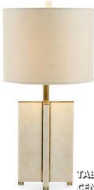
TABLE LAMP, CENTURY