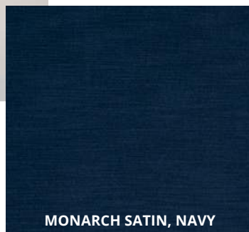
MONARCH SATIN, NAVY