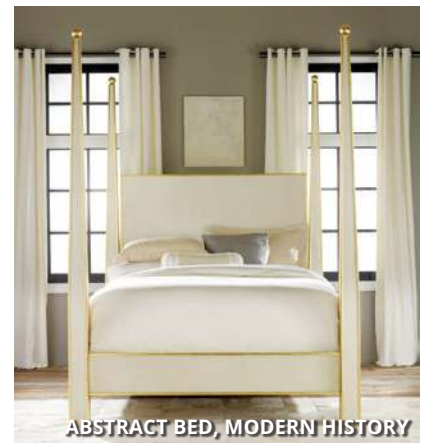
ABSTRACT BED, MODERN HISTORY