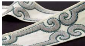
VELVET SCROLL, ZIMMER-ROFIDE