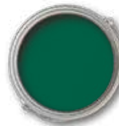
ANDREA WEST Benjamin Moore TRUE GREEN 2042-10

I'm loving saturated and vibrant jewel-tone greens. We used this to paint the cabinets in a butler's pantry that is sophisticated and timeless. Bold colors like this are best used in smaller, contained spaces such as pantries or powder baths where you can be more creative in your color choices. Saturated greens team well with warm, white-oak wood tones, black and whites, and gold metals.