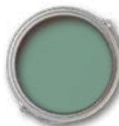
SUZANNE HALL Sherwin-Williams PARISIAN PATINA SW 9041

Green has a place in any room. When you play with its tone and saturation, it can be deep and dramatic or quite calm. This particular green has a little less yellow, leaning more toward a blue green. It reminds me of nature and the reflection dance that happens when the sky and surrounding green trees reflect onto water.