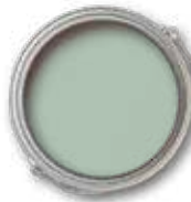
CARA FOX Farrow & Ball TERESA'S GREEN No. 236

It mixes so well with Carrara and calacatta marbles. We love pairing marble and mint, and we often introduce brass lighting or hardware to warm it all up. This color also works well with Benjamin Moore's Swiss Coffee.