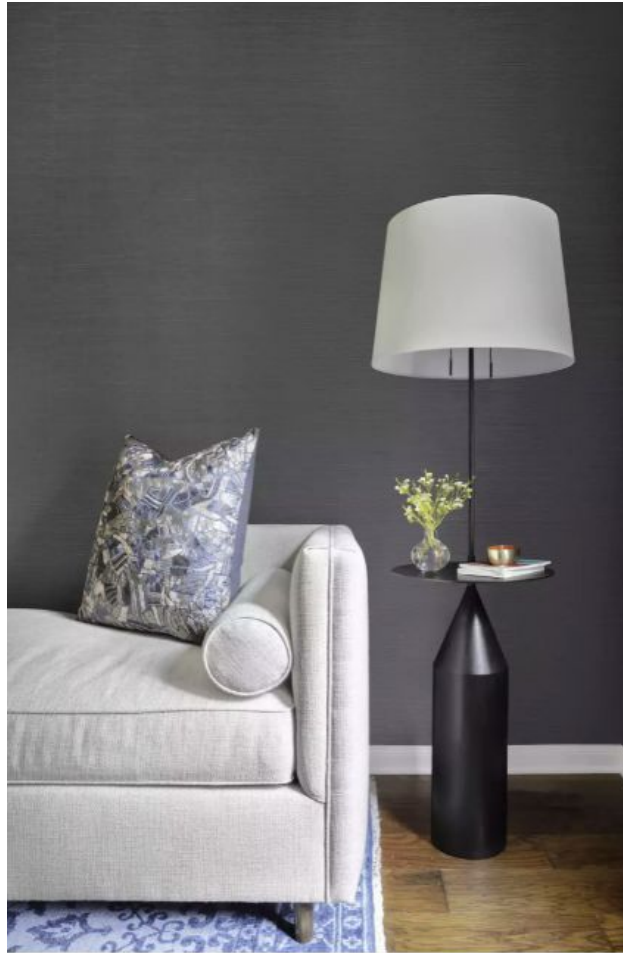
Cate Black for Etch Design Group

Not as into paint? There are plenty of styles of black wallpaper on the market, such as this one that is reminiscent of grasscloth, selected by Etch Design Group . There's no need to fill walls with artwork if you're drawn to a more simplistic look. If you're a renter, you can search for removable papers that will be easy to take down once your lease ends.